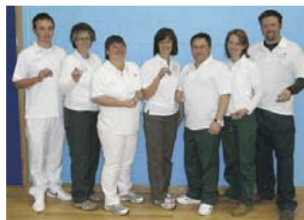
Winners at the 2008 Herts County Indoor Championships

Well done to all! Here's looking forward to a successful outdoor season too!